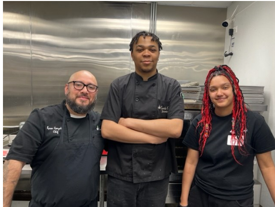
Kitchen staff and students