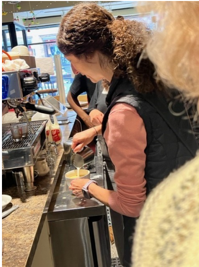
Instructions on making latte's