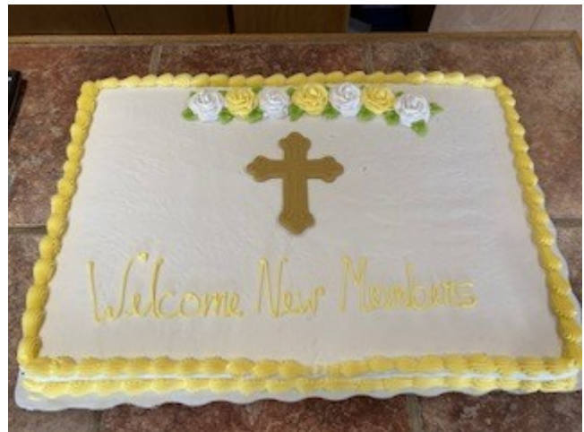
Of course we had lots of cake!