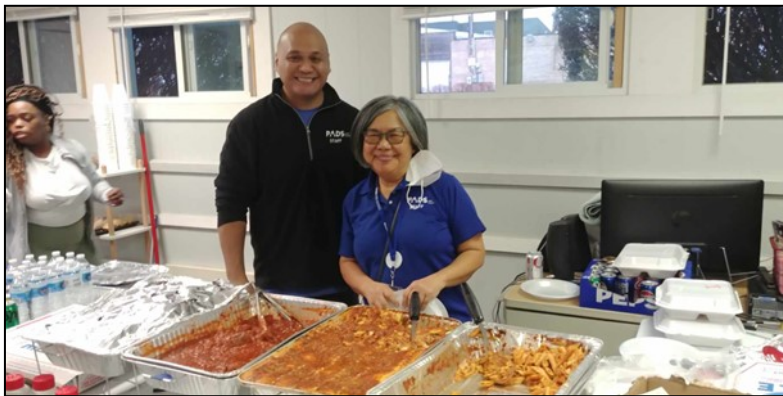
PADS staff serving meal.

PADS staff and volunteers offered holiday cheer to the over 400 clients in motels on December 16. 250 men, women and children enjoyed a delicious buffet style meal, received socks and coats if they needed them, and received bags of food to take back to the motels. The children were given presents that had been donated for the occasion. PADS staff is working as quickly as possible to find housing for the people, but there is not enough affordable housing, and many landlords don't want to rent to people with vouchers.