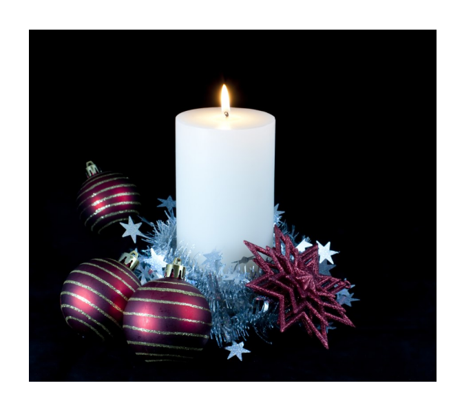
Christmas Greetings from the Home Jeam The Home Jeam wishes everyone a blessed and joyous Christmas and grace and peace in the New Year.