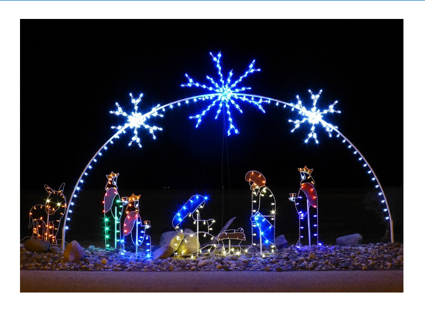
A Year to Lean

For most of us, likely all of us, 2020 has not gone the way that we had planned. In fact, who plans for a global pandemic, economic crisis, and the publicized threat of murder hornets? Likely none of us. But, the fact is that God was not caught off guard by any of this. God knew what would happen in 2020, just as God knows that will happen in 2021 and far beyond. This year has been a year to lean and not a year to rest. I think most years, most times we are a people at rest. We are fairly comfortable in our lives and in this land and we rest comfortable even in the midst of hardships. When something that happens that shakes us from our comfort (some might say out slumber), we are jolted into no longer resting, but leaning.