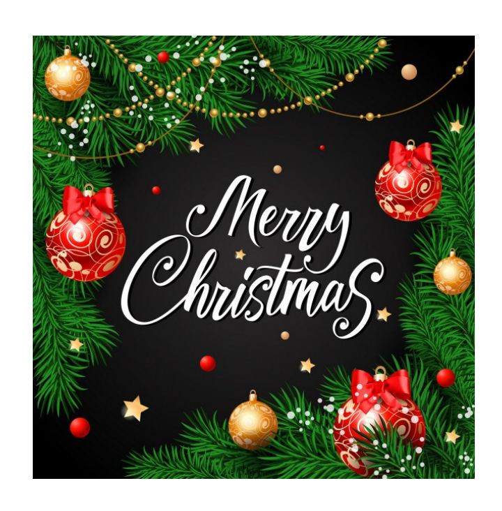
Wishing you a blessed Christmas season from the staff of United Protestant Church